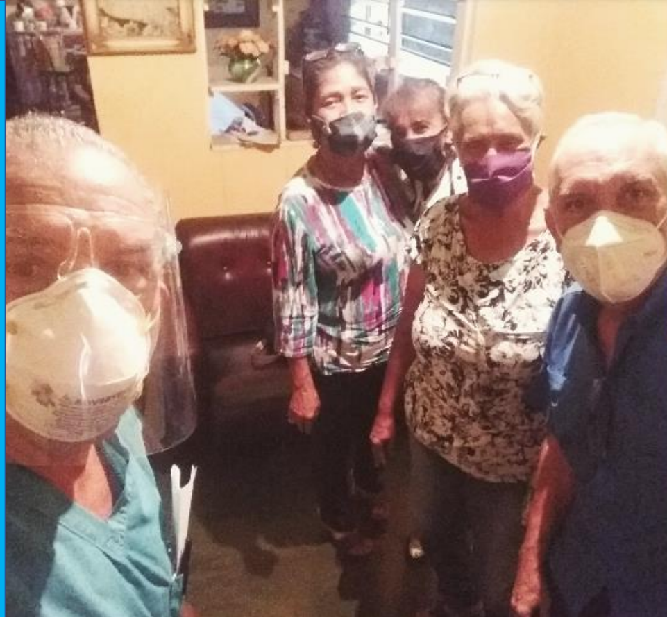
Our community leaders